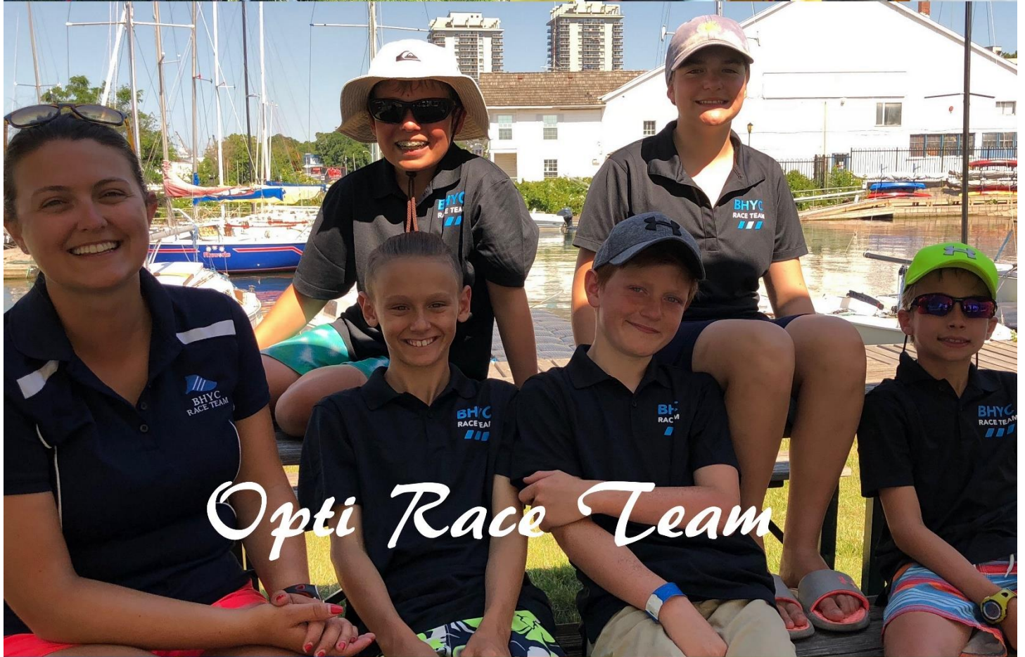
Opti Race Team