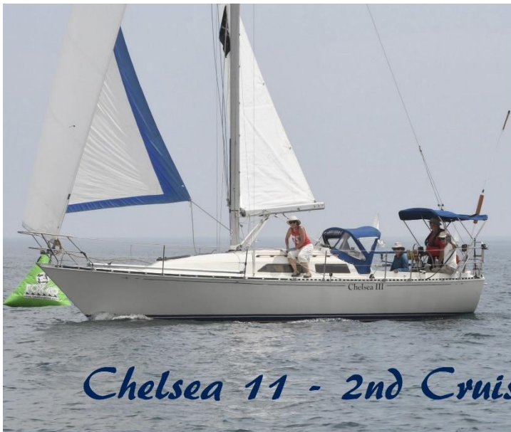
Chelsea 11 - 2nd Cruising