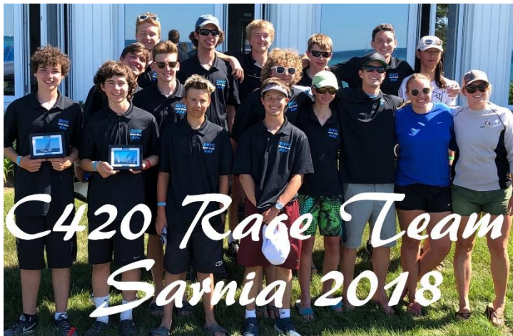
C420 Race Team Sarnia 2018