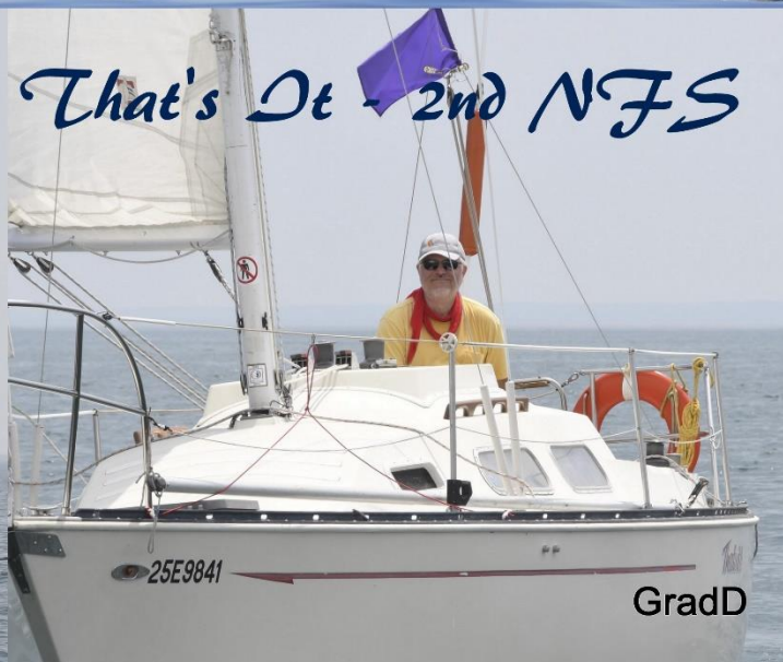
That's It - 2nd NFS