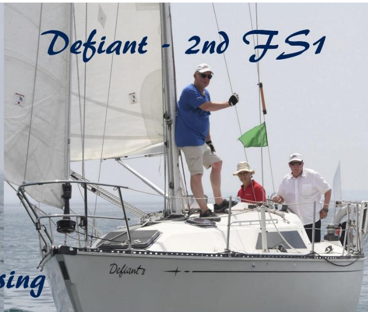
Defiant - 2nd FS1