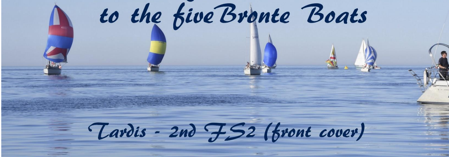
Tardis - 2nd FS2 (front cover)