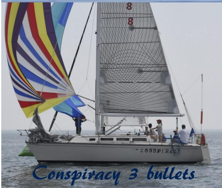
Conspiracy 3 bullets