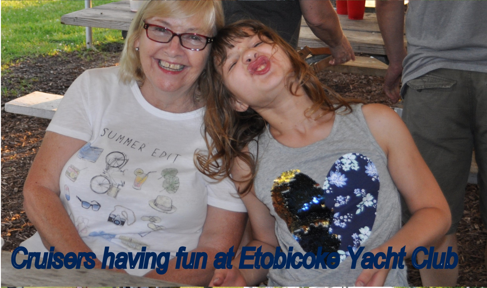
Cruisers having fun at Etobicoke Yacht Club