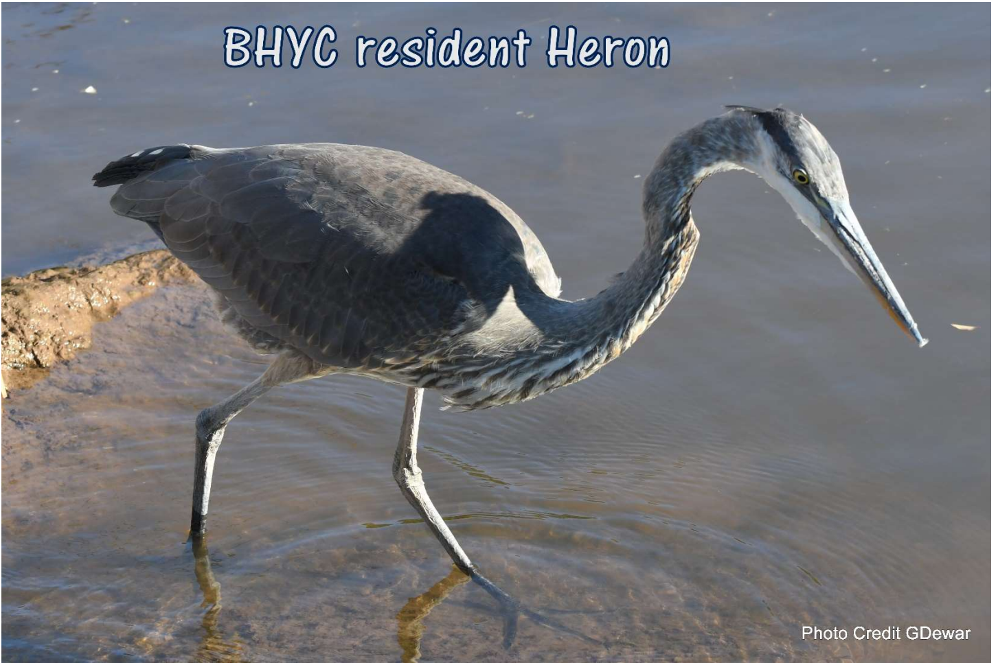
BHYC resident Heron