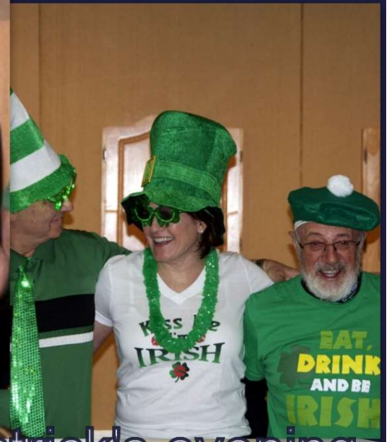
Leprachauns at St Patrick's evening