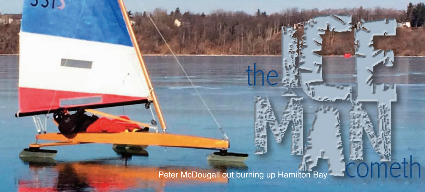
Peter McDougall out burning up Hamilton Bay